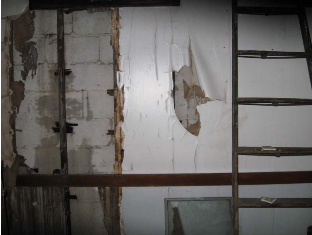
Former Provan Site. Left Side Office Area – 2 nd Floor. ½” thick gypsum wallboard on right side wall. (Sample Location SR-4)